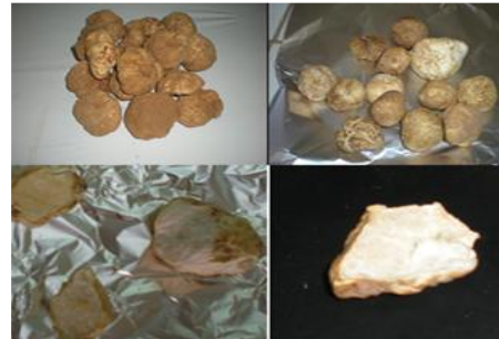
Figure 1: Truffle sampling.

Truffle sampling and size measurement (Figures 1 and 2).