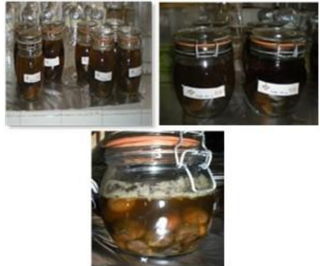
Figure 11: NaCl + citric acid solutions.

In this experiment, we can see that shelf-life is 17 months at a temperature of 100°C, while those at 80°C and 60°C are around 1 year. It can also be seen that preservation with a NaCl/citric acid solution lasts up to 17 months at a temperature of 100°C, compared with other temperatures. Contamination is rare, unless errors are made in applying the process ( Figure 11 ).