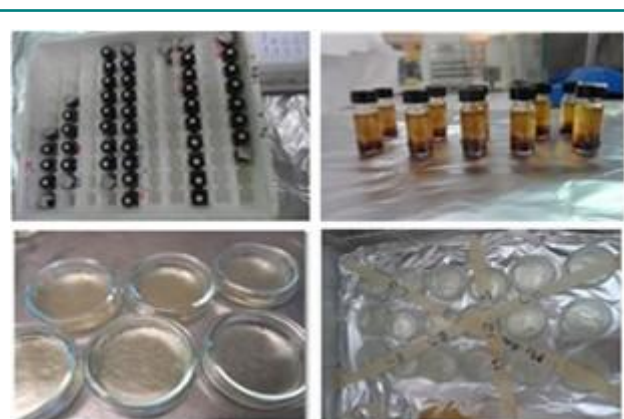
Figure 15: Aqueous extraction of truffles.