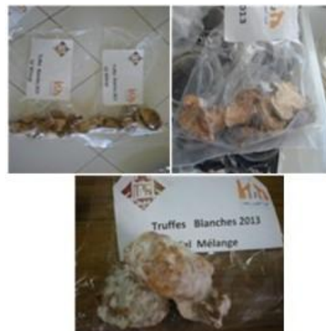
Figure 8: Preservation of white Terfess slices after steaming at 80°C for 48 hours.

The sliced truffles are stored in plastic bags under aerobic conditions. Those in anaerobic conditions are so far intact to the naked eye ( Figure 8 ).