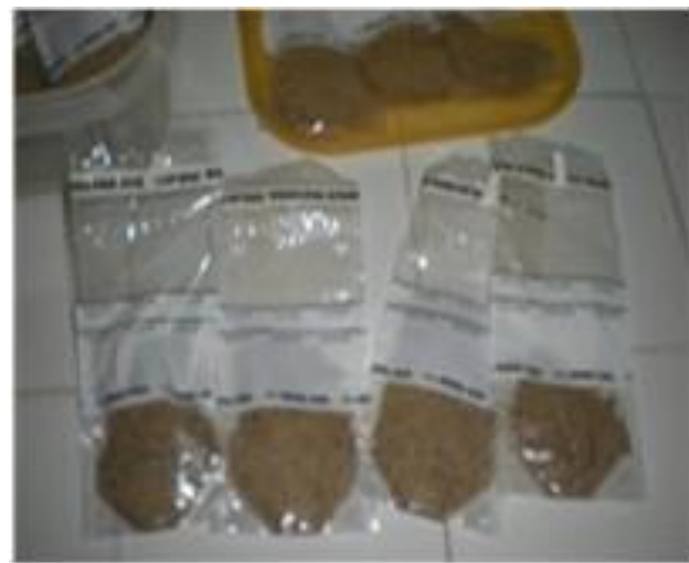
Figure 13: Terfess preserved in powder form.