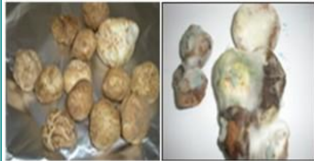
Figure 4: Sample in the open air after storage at room temperature.

After 3 days in ambient air, the crop is completely infested. So, it's this method of storage that is easily infected and ends up rotting after a few days ( Figure 4 ).