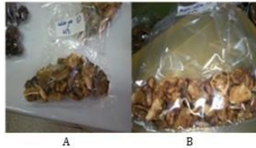
Figure 6: Sliced carpophores after 3-day drying at 45°C (A: Anaerobic and B: Aerobic).

Peeled carpophores are placed in hermetically sealed bags (anaerobic conditions) and under aerobic conditions are highly resistant to decay. Even after 4 years, they remain visually intact and free from rot. Whereas whole carpophores susceptible to rot are attacked by fungi after 1 month for hermetically sealed bags (anaerobiosis) and 2 weeks for aerobic bags (simple sealing) ( Figures 6 and 7 ).