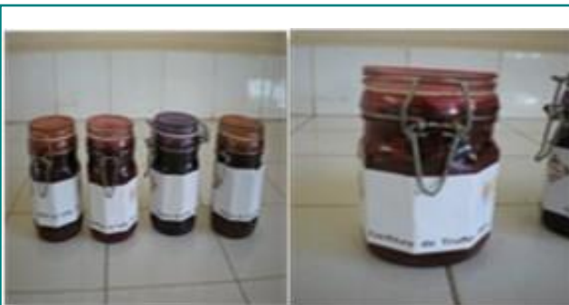
Figure 14: Truffles in jam.

The jam jars have a caramelized, sweet taste and keep for over a year ( Figure 14 ).