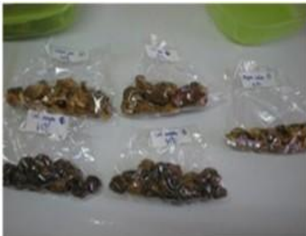
Figure 5: Peeled and whole carpophores in the oven.

Samples of large and medium-sized whole and sliced products are steamed for 3 days at 45°C. Peeled and whole products are then placed in plastic bags under anaerobic (vacuum) and aerobic conditions ( Figure 5 ).