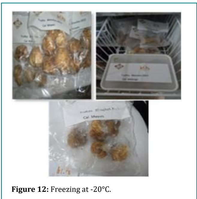
Figure 12: Freezing at -20°C.

Samples stored in boxes and sachets have a long shelf-life of over 3 years, keeping their original appearance intact and avoiding endogenous and exogenous contamination ( Figure 12 ).