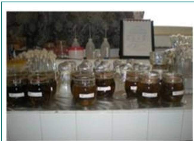
Figure 9: Sample autoclaved at different PH levels.

Followed by samples at temperatures of 80°C, which have a shelf life of 1 year. Those at 60°C are the last with 9 months. The lower the temperature, the more carpophores stored under these conditions are susceptible to attack, whatever the acid pH used ( Figures 9 and 10 ).